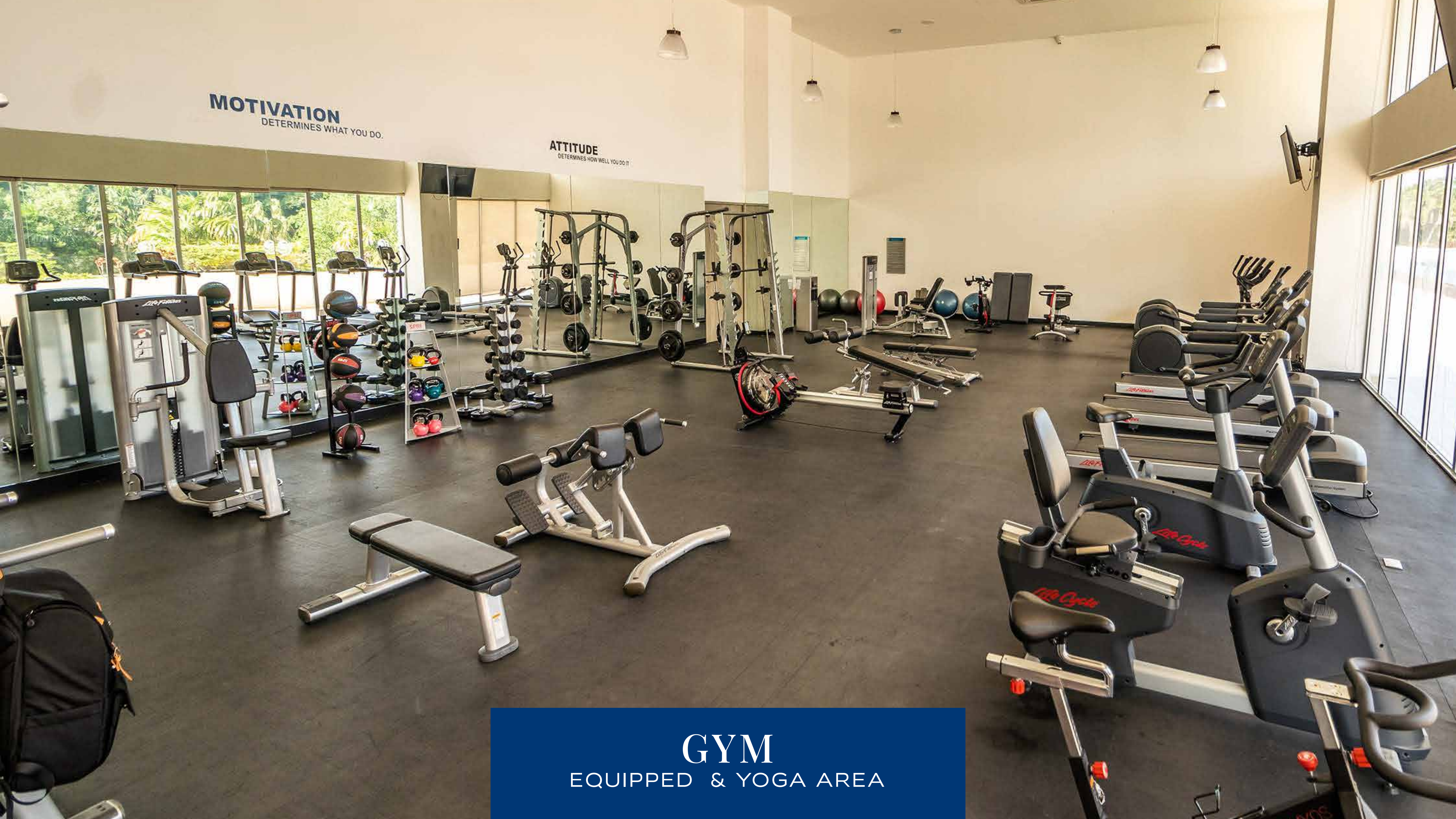
GYM EQUIPPED & YOGA AREA