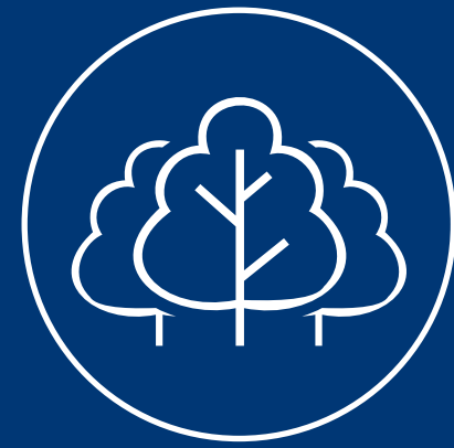
GREEN AREAS & TERRACE