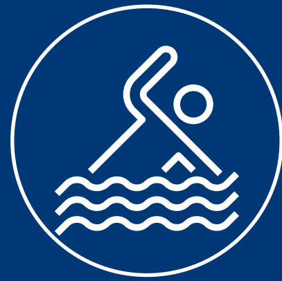
SWIMMING POOL KIDS POOL • JACUZZI • SUNDECK