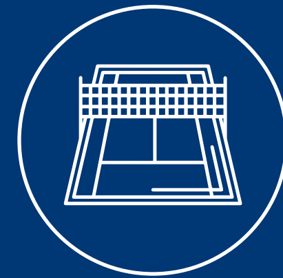
COURTS PADDLE • TENNIS