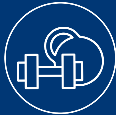
GYM EQUIPPED & YOGA AREA